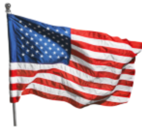
New Member Queen leading pledge and fast-tracking to her blue badge!