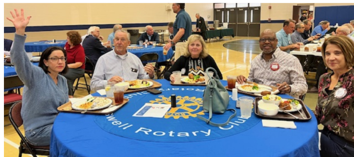
We all dance in our own ways!