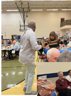
Chair Dancing to One Margarita!